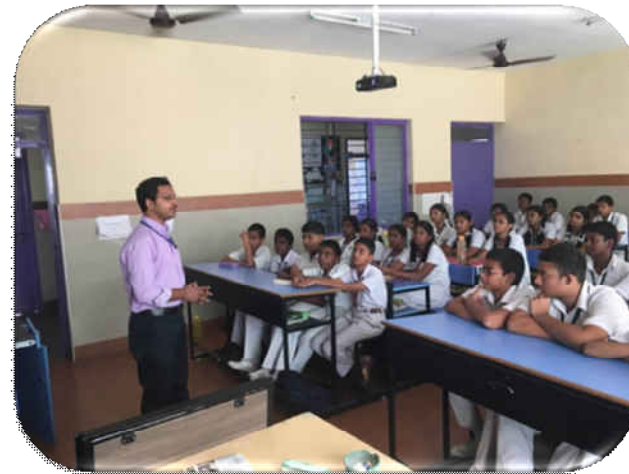
Oral hygiene awareness camp